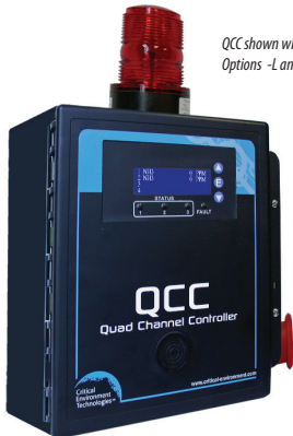
QCC shown with Options -L and -SW.